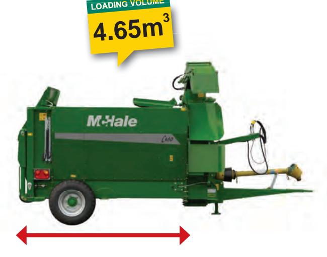
1.3M CONVEYOR LENGTH