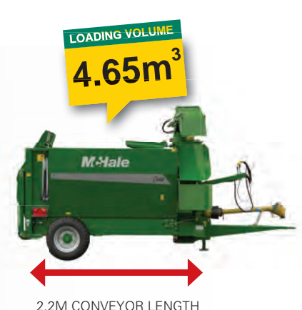
2.2M CONVEYOR LENGTH