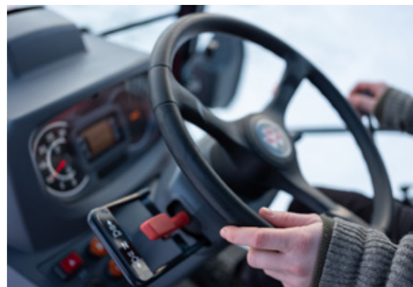
Mechanical transmission with Power Shuttle on the MF 1700 M-12Fx12R speeds for maximum comfort for each application.