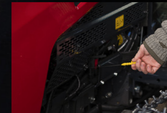
Simple and quick access for routine maintenance.