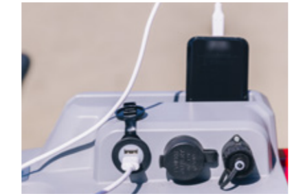
PHONE SUPPORT with 2 USB ports and 12 V socket