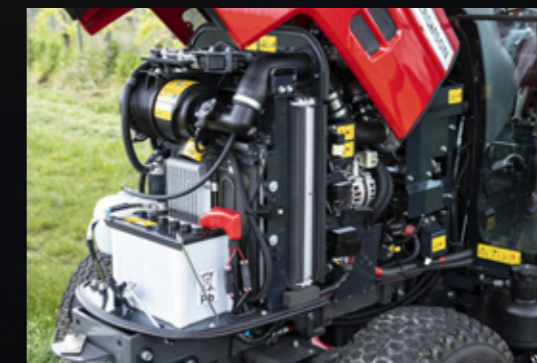
The waisted bonnet and front axle design ensures comfortable access to the engine.