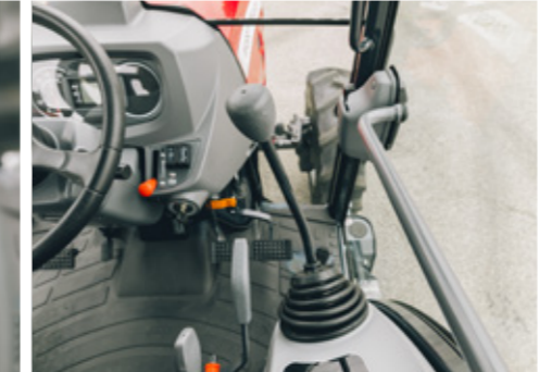
More comfort with the tiltable steering column and the right hand-side hydraulic joystick for easy and accurate implement control