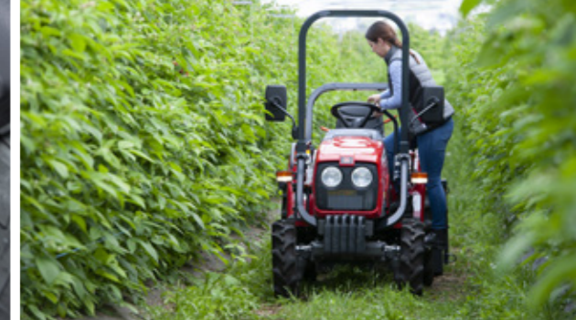
EASY ACCESS from both sides with foldable rear ROPS