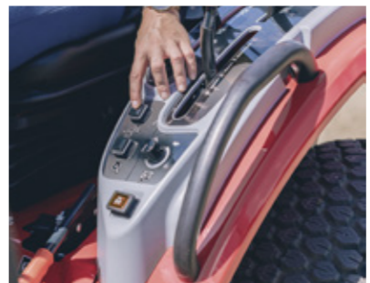
Easy operation with the Cruise Control

The MF 1525 uses a double pedal control with one for each driving direction, allowing clutch-less driving for more comfort.