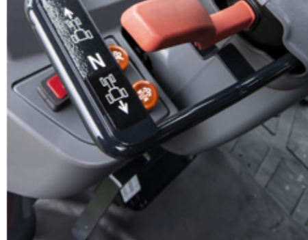
Electro-hydraulic shuttle lever on MF 1700 M models to improve comfort

Features may differ depending on model. Ask your MF Dealer for more details.