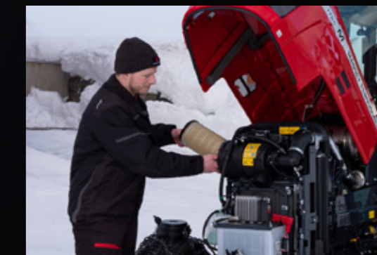
The well proportioned cooling package is easy to access, clean and maintain. The engine air filter is also very easy to access and clean.