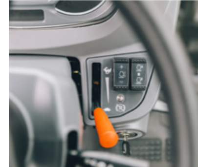
Handy controls to set and activate the engine speed