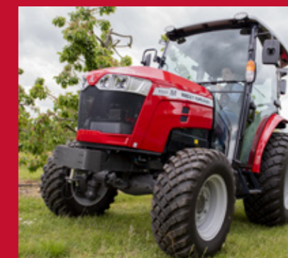
MIXED SERVICES TYRES