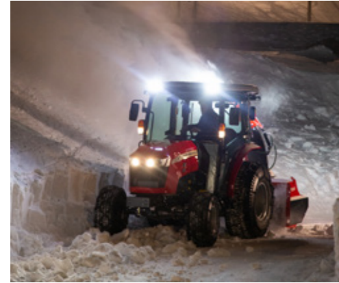
4 LED WORKING LIGHTS – two front and two rear

SOMETIMES IT'S THE SMALL DETAILS THAT CAN MAKE A HUGE CHANGE TO YOUR WORKLOAD.