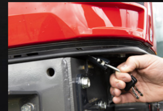
Easy bonnet opening.

Everything we offer has been scrutinised by our engineers from all perspectives – optimum compatibility with your machine, safety, durability and performance. You'll get expert service from your Massey Ferguson dealer who has all the necessary installation tools and knowledge at their fingertips.