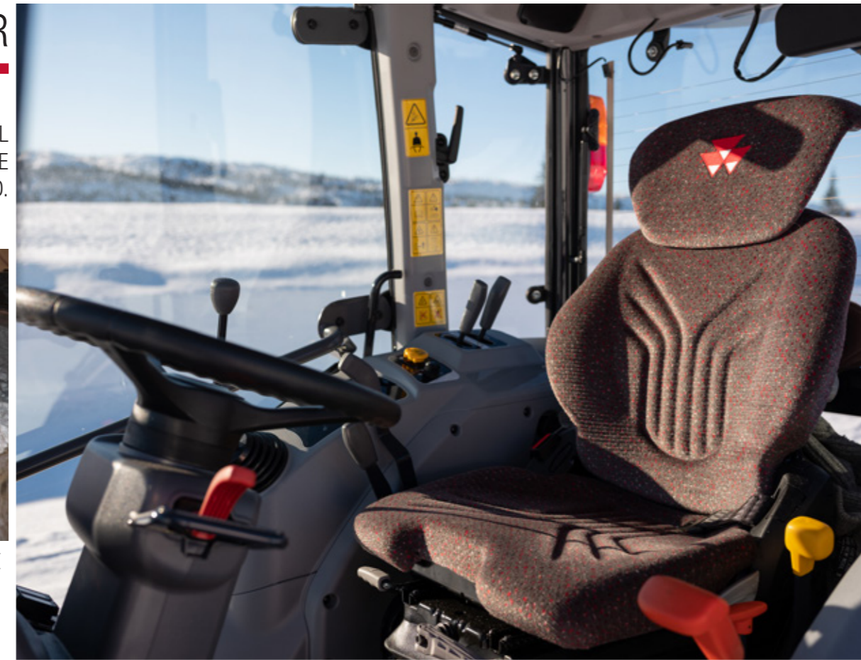
COMFORTABLE WORKPLACE FOR AN EASIER DAY Optional air suspended seat available